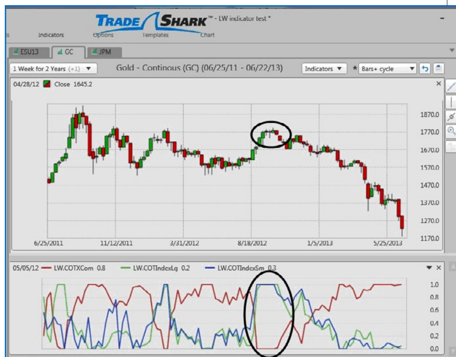
FIGURE 1: A TOP IN GOLD? The opposite-position statuses of the commercials (red line), the small traders (blue line), and the big traders (funds) suggest a top in gold prices in the fall of 2012.

Williams' approach in this basic course focuses on analyzing data to find the fundamental setups that are most likely