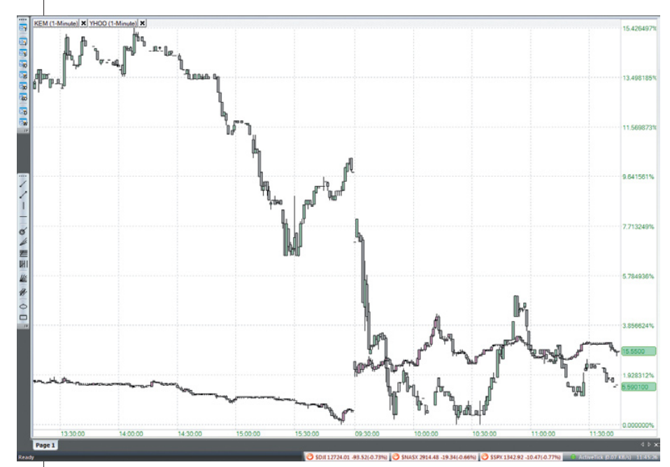
FIGURE 5: STACKING CHART WINDOWS. AT users can choose to plot two stocks on the same chart to compare relative performance; KEM and YHOO battle for supremacy on May 14, 2012.

unique trading style. One of the indicators I use is the Aroon, and I was pleased to find that it comes standard in AT.